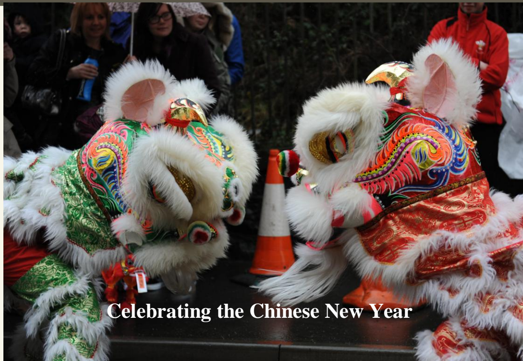
Celebrating the Chinese New Year