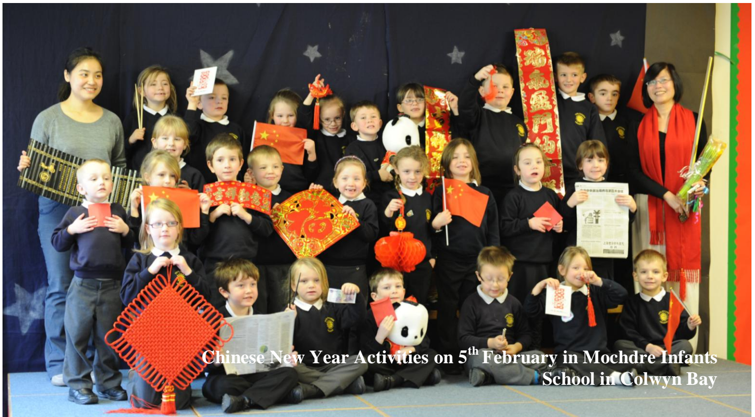
Chinese New Year Activities on 5 th February in Mochdre Infants School in Colwyn Bay

Students with Chinese elements in hand, such as the Spring Couplets, Chinese national flags, Chinese knots, red lantern, panda, character "fu" and even the Labor Newspaper from China.