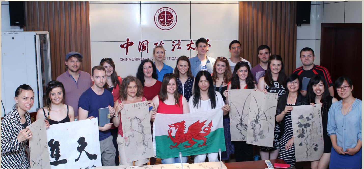
Graduation ceremony group photo.