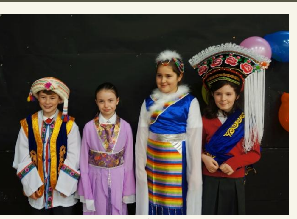
Students get dressed in ethnic costumes